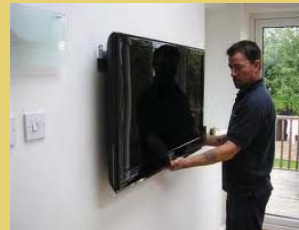
Hang TVs & Cabinets

InSoFast panels are manufactured with closed-cell rigid foam and built-in fully insulated studs providing for the perfect insulation job with no gaps, leaks, or thermal short circuits. According to a DOE study, continuous insulation like the InSoFast wall system outperforms a 2x4 framed wall with R-13 fiberglass insulation by 8%.