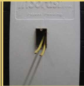
3. Run Electrical Wiring

This job couldn't get any easier. The self-aligning panels with built-in notches ensure that the studs and panels are in perfect alignment.