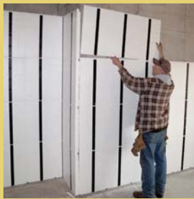
2. Press into Place

Screw, nail, or adhere. Bonding with adhesive will not make holes in the foundation. A bead of adhesive can outperform screws spaced 6" apart.