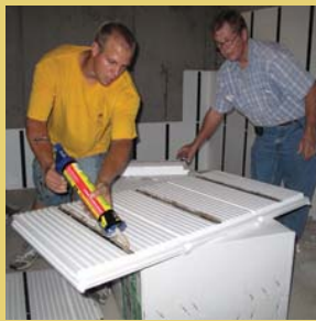
1. Apply Adhesive

Screw, nail, or adhere. Bonding with adhesive will not make holes in the foundation. A bead of adhesive can outperform screws spaced 6" apart.