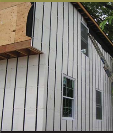
High Performance Continuous Insulation

InSoFast panels are manufactured with closed-cell rigid foam and built-in fully insulated studs providing for the perfect insulation job with no gaps, leaks, or thermal short circuits. According to a DOE study, continuous insulation like the InSoFast wall system outperforms a 2x4 framed wall with R-13 fiberglass insulation by 8%.