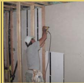
4. Fasten Drywall

Built-in utility chases make wiring simple. After panels have been installed, cut out for box locations. Simply slide wiring through chases.