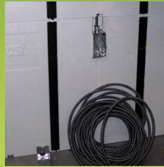
3. Run Electrical