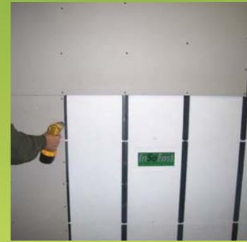
4. Install Drywall