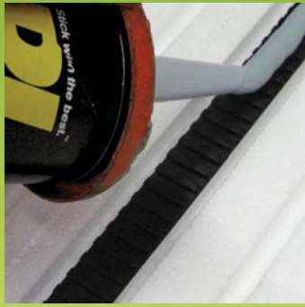
1. Apply Adhesive