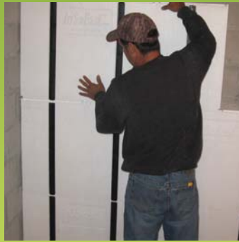
2. Press into Place